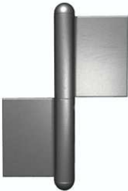
LEFT HAND HINGE